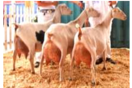
Supreme Dairy Herd of Show, OR State 2010 1 st place get of sire (K. Tach Lach), W WA State